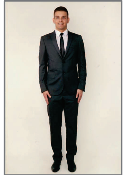
10cms x 15cms 4" x 6"