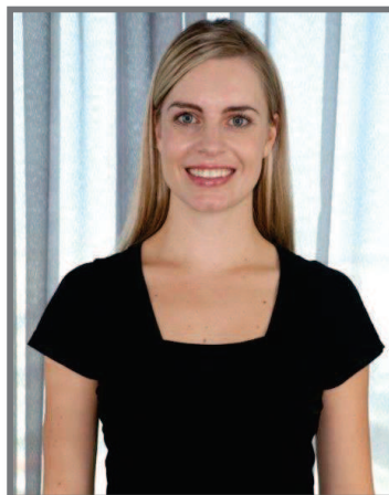
10cms x 15cms or 4" x 6"