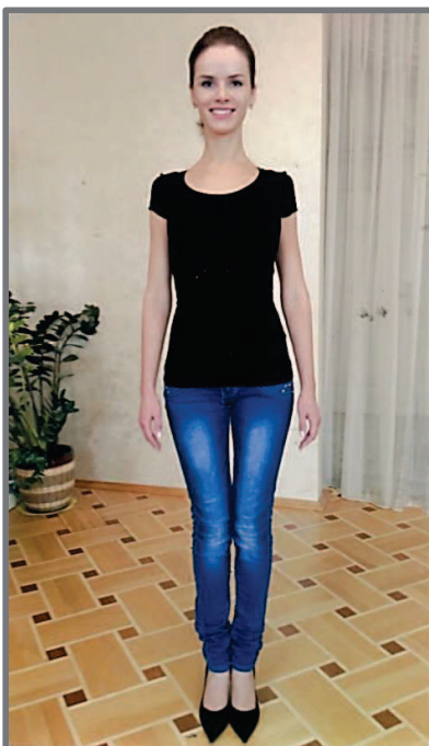
10cms x 15cms or 4" x 6"

1x full length (standing, photo from head to toe) and 1x close up (standing, photo from head to waist) casual photos. Please refer to the photos below. Your attire and surroundings should be conservative and reflect your professional image. You must be standing up, straight, facing the camera, hands flat by your side with you hair behind the ears and shoulders.